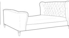
6' Bed Frame (Superking)