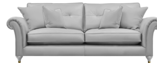
Grand Sofa (3-Seater)